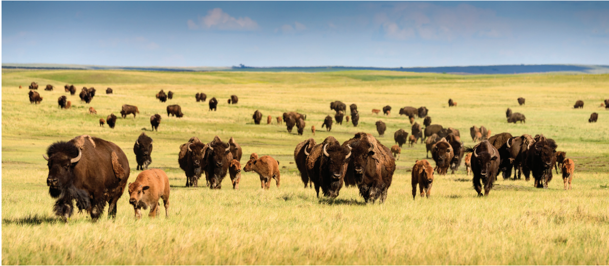
Take an exciting open-air Jeep tour through Custer State Park to view the herds of American bison

geysers, and hot springs. Then, head for storied Old Faithful geyser, named for its regular eruptions about every 80 to 90 minutes for some 150 years, before returning to your park lodge. Meal: B