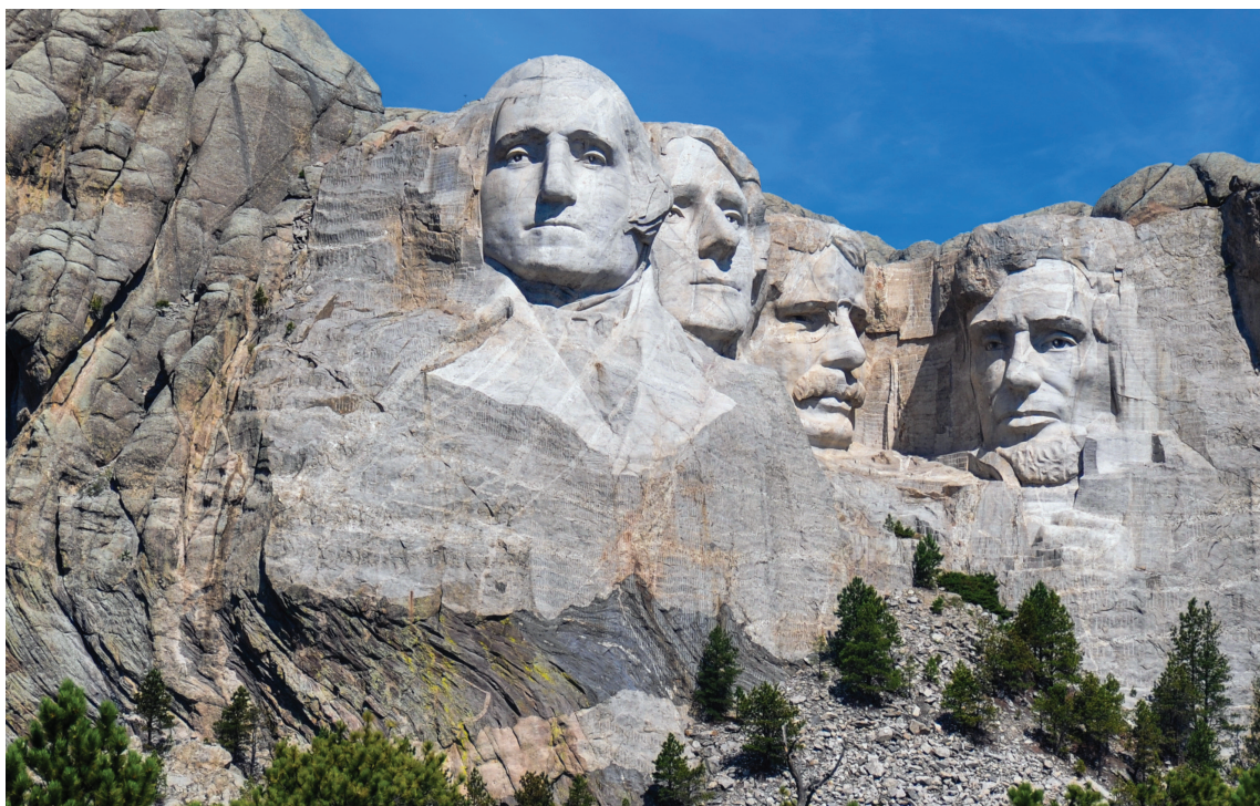
Visit Mount Rushmore National Memorial, the largest statue monument in the world